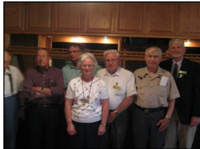
Installation of officers at the New Castle Lion Club