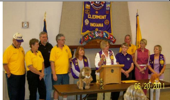
Installation of officers at the Clermont Lions Club →