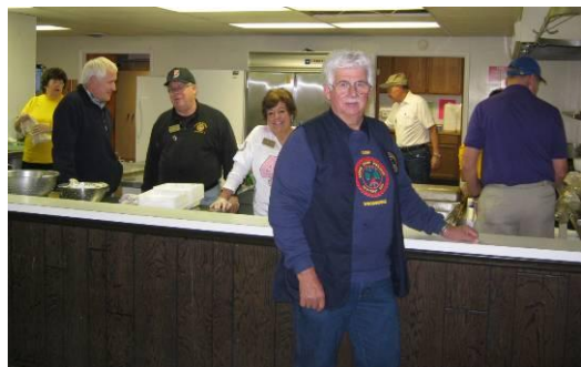
Below and below left are pictures from Pork Chop Day at Camp Woodsmoke.