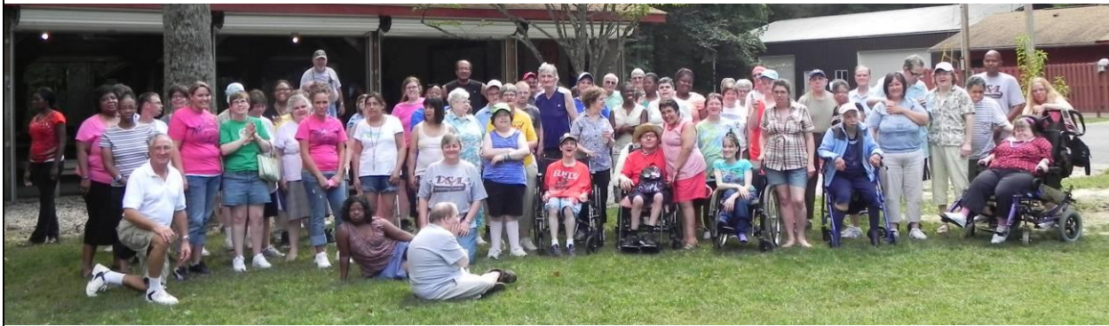
The Greenfield Lions Club on August 13 took 119 campers with their staff to Camp Woodsmoke. The club provided two meals, entertainment, crafts, hiking, games and a dance for the very appreciative campers.