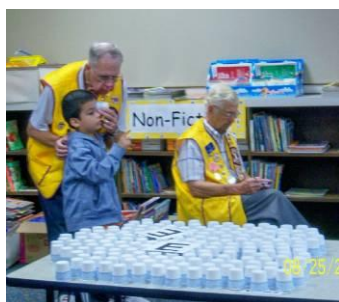
Chapel Hill Lions does eye screening for all students in Wayne Township Schools

Purpose: To support both the Lions Club and the Charlottesville Fire Department