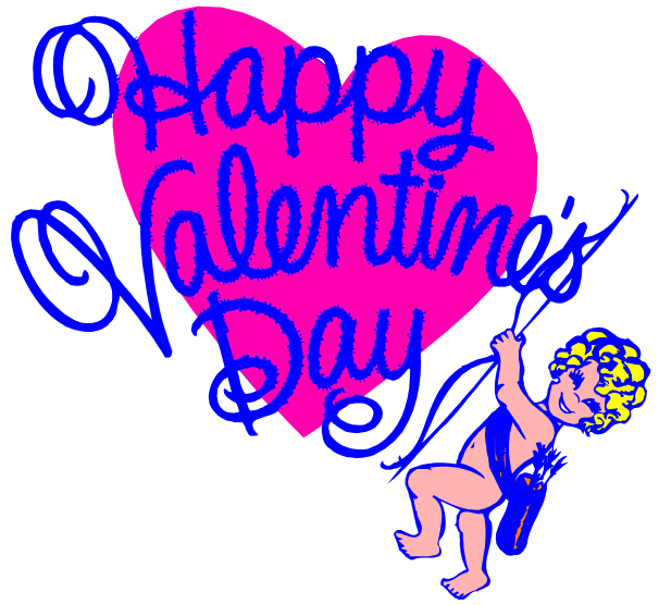
VALENTINES DAY FEBRUARY 14, 2006

DG EARL WHIPPLE P. O. BOX #644 CONNERSVILLE, INDIANA 47331